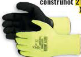
construhot 2131 X2X