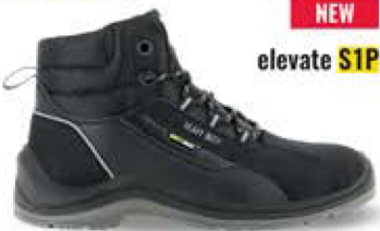
NEW elevate S1P

Sole PU/PU Toecap Steel Midsole Puncture Resistant SJ FLEX Lining Mesh Nylon Insole Premoulded Category S3 / SRC Size Range 36-47