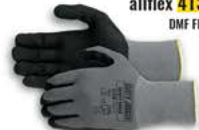
allflex 4132 DMF FREE