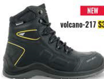
NEW volcano-217 S3

Sole PU/PU Midsole Puncture Resistant SJ FLEX Insole Latex Size Range Volcano 36-47 / Lava 38-47